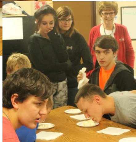
Members and potential members participate in a number of Minute-to-Win-It games and a Bean Bag Tournament.